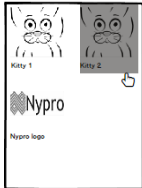
Preview - Kitty 2